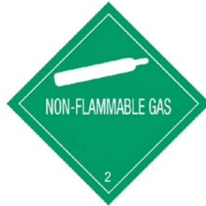
Figure 3: Nonflammable Gas Shipping Label

Customers must be aware of the importance of correct valve positioning on liquid helium dewars. Loss of product or potentially hazardous conditions may result from improper valve configuration.